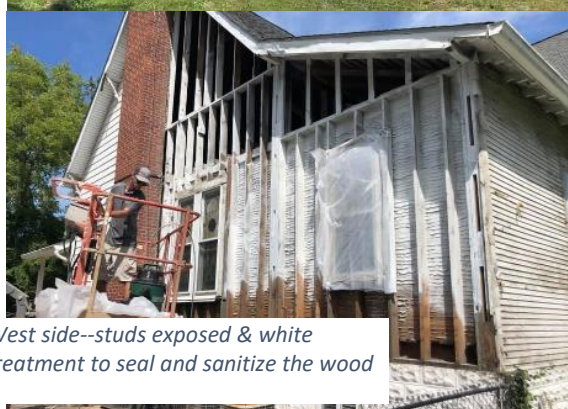
West side--studs exposed & white treatment to seal and sanitize the wood