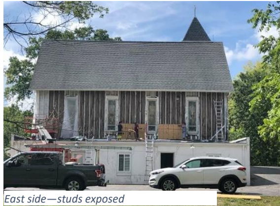
East side—studs exposed

Lady Bug and Hoosier Exteriors began working together to remove the siding down to the studs. Then they began sanitizing the structure and to safely keep the bats from returning.