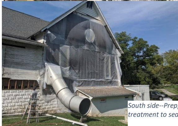
South side--Prepping exterior for treatment to seal the exposed wood