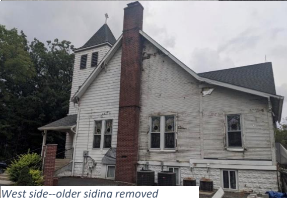
West side--older siding removed