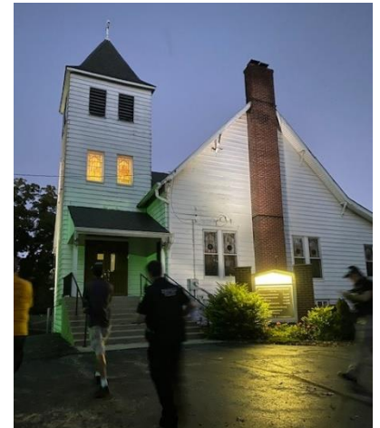
Filming at night