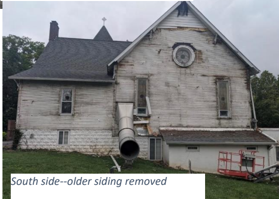
South side--older siding removed