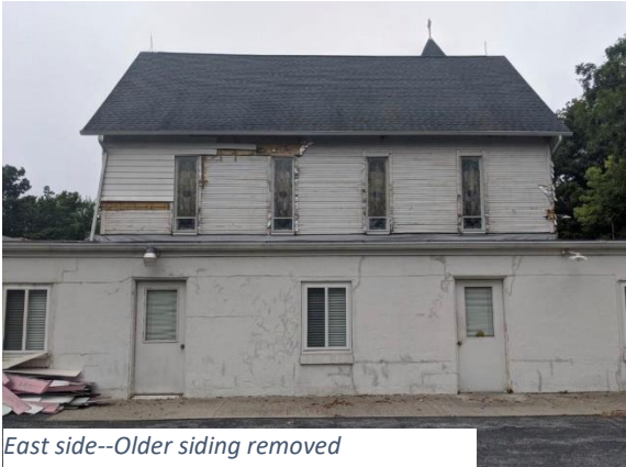
East side--Older siding removed