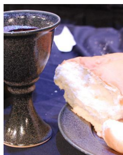
World Communion day October 4, 2020